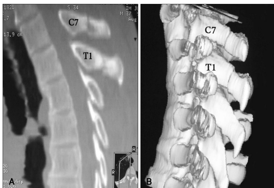
FIGURE 2. Cervicothoracic CT shown C-7 and T-1 spinous process fracture. CT: computerized tomography.

The complex motions of such type of fracture have been described in details, first by Le Baron and then by Sicard and Carrage. 6-8) In the present case, it was from complex of above multiple mechanism. The first is the indirect true avulsion-type fracture by counterforce between the thoracic cage and cervicothoracic junction. The second may be regarded as a stress-related, fatigue-type fracture. The fracture line is usually located in the middle of the spinous process which are the most weakest point in the spinous process. 1) The distal fragment is usually displaced downward and laterally (Figure 1). The two ends are often widely separated, and as a result, nonunion is common. The most useful imaging study for a cervical spine fracture is radiography. A double spinous process shadow at the affected level can be detected from antero-posterior