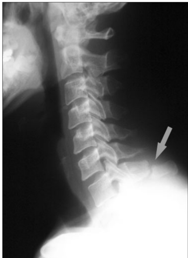
FIGURE 1. Simple X-ray C-7 spinous process avulsion fracture with inferior displacement.

ture is very similar to so called "Clay-shoveler's fracture". 1,2) It is known as an occupational injury which occurs when workers shovel heavy loads for a long time. This type of fracture has been increasingly seen in sports-related in-