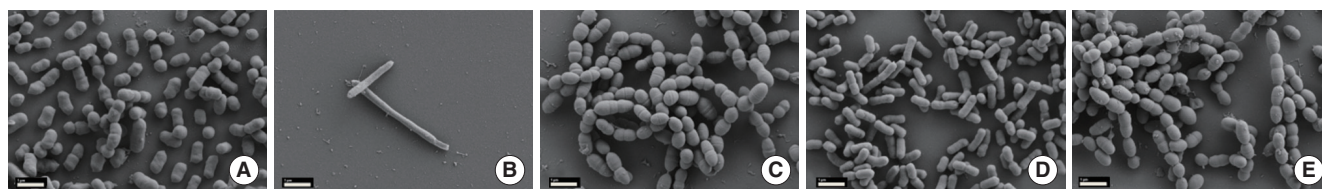
Figure 3. Representative scanning electron microscopy images of the biofilms after 24 hours ( \times 30,000 ): (A) Porphyromonas gingivalis , (B) Fusobacterium nucleatum , (C) Streptococcus gordonii , (D) Aggregatibacter actinomycetemcomitans , and (E) multispecies bacteria. Bars = 1 \mu m.