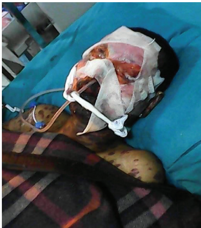
Fig. 3. The patient with nasogastric tube and extensive sloughing off of epidermis of the face.

critical cytokines (tumor necrosis factor- \alpha [TNF- \alpha ], interferon- \gamma [IFN- \gamma ]), and drug-induced inflammatory mediators (perforin, granzyme-B released from cytotoxic T-lymphocytes and granulysin secreted by cytotoxic T-lymphocytes and natural killer cells) from the circulation [4]. However, the plasma exchange remain unsupported by controlled studies [5]. Subsequent systemic treatment included intravenous Ceftriaxone 1.0 gm 12 hourly (microbial findings on skin: Staphylococcus aureus and Pseudomonas aeruginosa ; the symptoms and signs being warm, tender, erythematous, and edematous plaque over lower extremities with ill-defined borders), intravenous immunoglobulins (IVIG) 1.0-g/kg body weight/day infused over 6 hours for 3 successive days and corticosteroids 0.5-mg/kg body weight. Intravenous tramadol 25 mg was given for analgesia as per the patient's condition. The patient recovered completely after 5 weeks of intensive systemic and topical treatment.