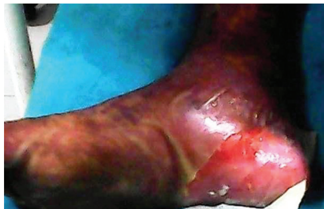
Fig. 2. Large confluent areas of full detachment of epidermis over heels.

characterized by epidermal necrosis, extensive detachment of the epidermis, erosions of mucous membranes and severe constitutional symptoms [2, 3]. This case describes a rare documented rapid-onset hypersensitivity of Ibuprofen causing SJS-TEN in a Nepali male.