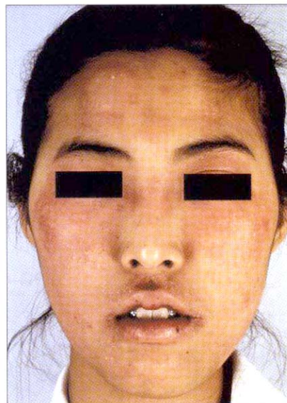
Fig. 1. The facial atopic lesion in Case 1: prior to treatment with Elidel.

erythematous, pruritic, and scaly skin lesions evenly distributed on her face (Fig. 1). She had a long history of AD since childhood. Her facial lesions initially responded to topical corticosteroid treatment, but then became resistant to this medication. She did not have any special past medical or family history. 1% Elidel cream was applied to her facial lesions twice a day. Within 2 weeks of the applica-