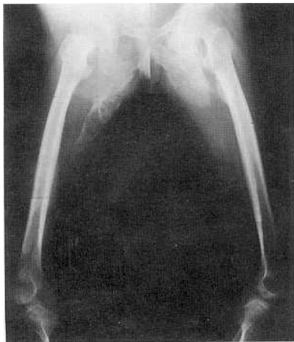
Fig. 1. Plain X-ray revealed HO at both hip joint areas, the entire right thigh and the left upper thigh.

A Plane X-ray revealed HO at both hip joint areas, the entire right thigh and left upper thigh (Fig. 1). There was no interval change compared to the previous plane X-ray. Although the patient was given 100 mg of oral indomethacin daily, the pain in both lower extremities continued to become further aggravated over time. His indomethacin dose was increased to 150 mg daily, but he was unable to sleep through the night because of the pain. In addition, he could not undergo physical nor occupational therapy. Given a visual analogue scale with which to rate the pain, he indicated a score of ten, but it could not be considered very accurate due to mild cognitive dysfunction.