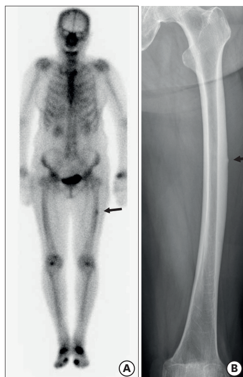
Fig. 2. An 81-year-old woman had left thigh pain for 2 months. (A) Bone scan showed hot uptake (positive finding) at the middle of femoral shaft, and (B) anteroposterior radiograph of femur revealed atypical femoral incomplete fracture. She did not have any pain or complete fracture at 11 months later.

Visual evaluations of radioisotope uptake in femur were performed independently by two orthopaedic surgeons, who were unaware of patient clinical information and radiological findings. Uptake in the femur on the involved lesion was classified as positive (increased uptake) and negative (normal or reduced uptake) (Fig. 2). When the two observers disagreed on the evaluation of the uptake, the final decision was made by a third observer.