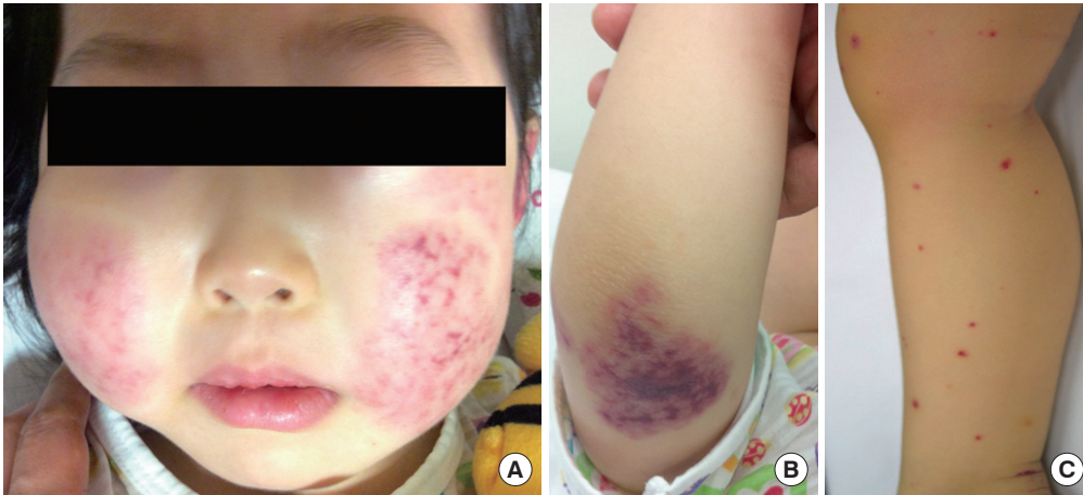
Fig. 1. Reticulated purpuric swollen lesions on the face (A) and left elbow (B), multiple rice grain sized palpable purpuric papules on the right leg (C).