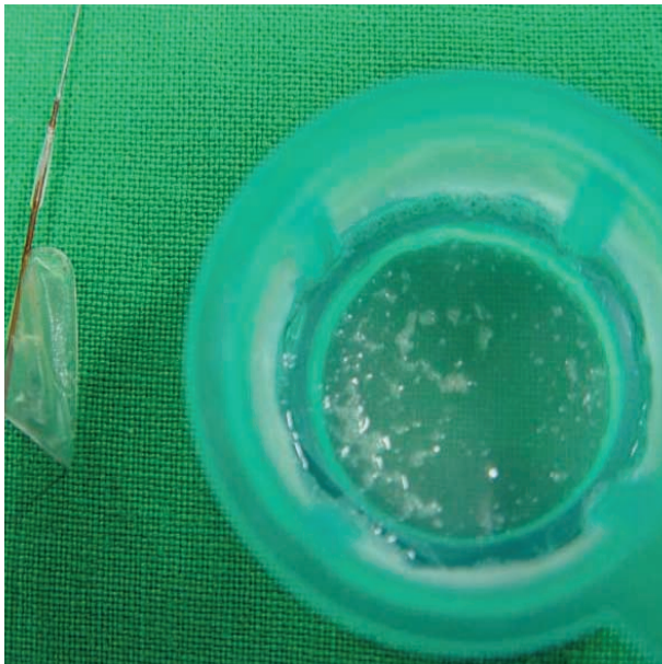
Fig. 4. After retrieval of FilterWire EX, whitish debris was noted within the basket.

cases after filter removal. In our case, complete flow interruption was developed after postdilatation of the stent. We suspected this pseudo-no-reflow phenomenon was induced by obliteration of filter pore by massive atherosclerotic debris. We considered to remove filter by retrieval catheter, however, this process may cause entrapment of filter device to retrieval catheter and embolize massive amount of atherosclerotic debris. Therefore, we choose aspiration thrombectomy using Export Aspiration catheter. After aspiration thrombectomy, flow interruption in the right internal carotid artery was completely restored, therefore, we confirmed this phenomenon as pseudo-no-reflow phenomenon instead of true no-reflow phenomenon. Yadav (4) recommended practically in his review paper if there is no forward blood flow during carotid