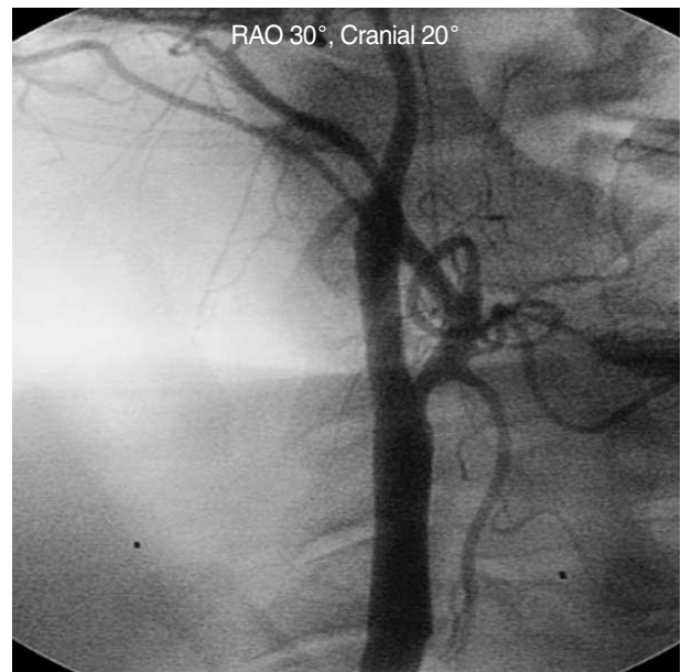
Fig. 3. After aspiration thrombectomy, antegrade flow was fully restored. RAO, right anterior oblique.