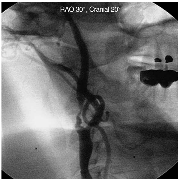
Fig. 1. Carotid angiogram showed severe stenotic lesion in the right internal carotid artery. RAO, right anterior oblique.