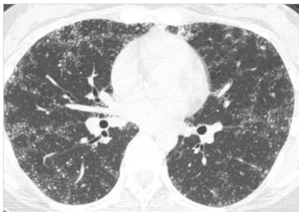
Fig. 1. Chest computed tomography shows diffuse micronodules and ground glass opacities in both lung fields.