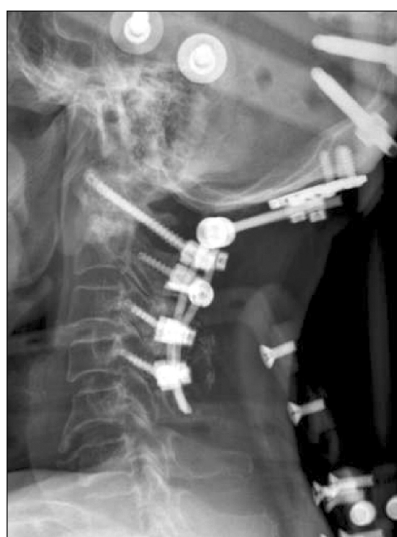
Figure 3. Postoperative lateral plain radiograph of the cervical spine showing posterior occipital-C4 fusion.